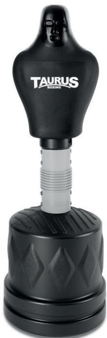
Art. Nr. TB-3000