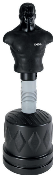
Art. Nr. TB-3200